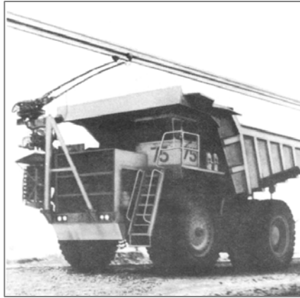
Figure 3. Trolley truck operating at the Quebec Cartier iron ore mine, Lac Jeannine, 1970s. 24

The particular features of electric motors that make them more efficient than comparable internal-combustion engines are: (i) higher torque at low speeds, thus requiring less fuel use and a smaller engine; (ii) smaller engines mean less weight to carry, also meaning less fuel use; and (iii) electric drive systems can have regenerative braking—motive energy is captured when decelerating rather than lost as friction heat—again resulting in energy savings.